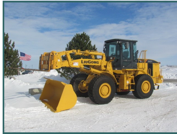
Checkout our equipment at www.Buyaloader.com